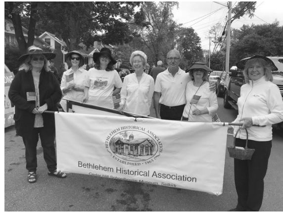
Getting ready to step off at the 2018 Memorial Day Parade