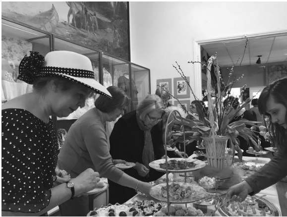
Folks enjoying the goodies at the Afternoon Tea.